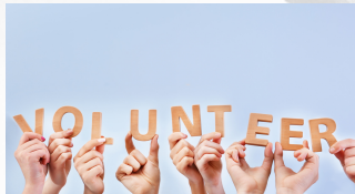
Pic of Hands Volunteer

The Town is looking for resident volunteers for the 21 Highland Future Use Committee. Two of these openings require a resident who lives within a 1/2 mile of the building. Currently 21 Highland houses the Recreation Department and Youth and Family Services.