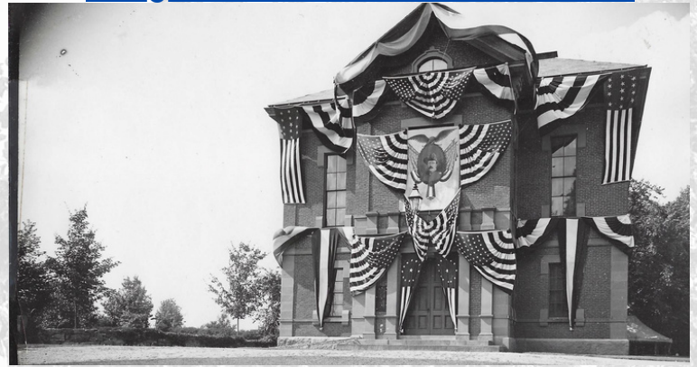
Picture of Southborough Property

This historical gem of a picture was taken during the visit of a very important person! With our Tricentennial coming up, we will be sharing more of our Town's history. President Theodore Roosevelt visited Southborough in the early 1900s to speak to students at St. Mark's regarding a recent hunting trip. The Town House was decorated accordingly with red, white and blue bunting in his honor. His picture was hung from the middle of the second floor to welcome his arrival.