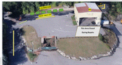
Pic of temp procedure

Please be advised the Trash Hopper at the Transfer Station will be closed for repairs for approximately 1 week beginning March 4, 2024.