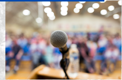
Pic of Microphone

Town Meeting is being held March 23, 2024 at Trottier Middle School (49 Parkerville Road). The meeting starts at 10AM this year and will go through the day with no scheduled breaks. Some highlights from the Warrant include: