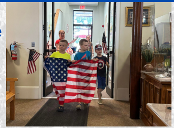
4th at the Town House

We are lucky at the Town House to have the Library’s 4th of July Parade march their way through the building with their patriotic gear and music playing! It was a great showing of kiddos and their parents. Thank you to all who participated and brought big smiles to the employees at 17 Common Street. We appreciate you!