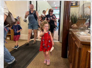
Pics of Parade Participants