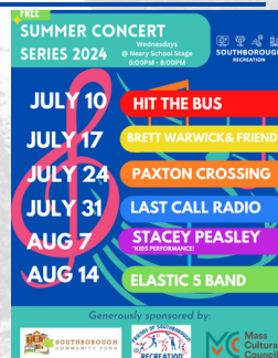
Band Concert Flyer

Please come, bring some chairs and blankets and make a fun night with friends and family! Thank you to the Cultural Arts Council, Friends of Recreation and the Southborough Community Fund for supporting these great concerts!