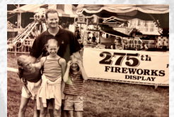
Residents @ 275th Celebration