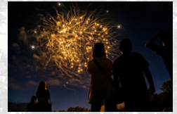
Summer Nights

Years past have had bounce houses, rock walls, bands, food trucks galore and ends with fireworks at dark. It's always a fun-filled night to round out the summer. Parking begins at 5PM. We hope to see a big community turnout at this wonderful event!