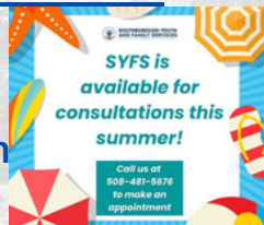
SYFS Consult Flyer

Before school starts back up, this is a great time to do a mental health check up for family members. If you're a Southborough resident and there are things that are worrying you with the upcoming school year, why not make a consultation appointment with Youth and Family Services? They can help you navigate what's typical and what may need additional support...and help you find it. SYFS services are confidential and always free! Call to 508-481-5676 to make an appointment.