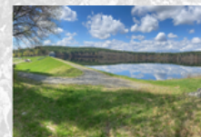
Pic of Land

Love the outdoors? Want to help protect Southborough's natural spaces? The Conservation Commission is looking for one volunteer to fill current vacancies!