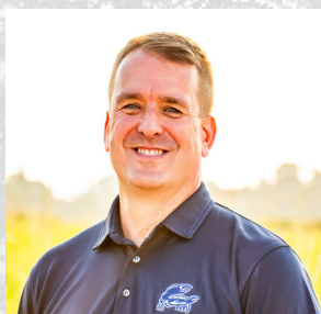
Mark Purple 2024

Discover practical strategies to: maintain motivation without overstepping boundaries; provide meaningful support during the waiting period; navigate this challenging time together. Click here to secure your place in this session: https://shorturl.at/bWJSt .