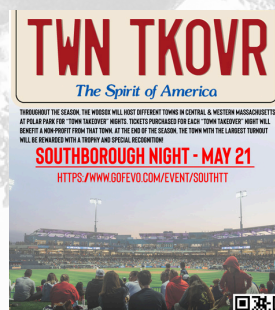
Woo Sox Night Flyer

For the second straight year, the Woo Sox will host a number of towns and cities from across the State at Polar Park for "Town Takeover" nights. The "Battle of the Boroughs" takes place on Wednesday, May 21st at the 6:05 PM game. We will be battling it out with Marlborough and Westborough for highest attendance! Purchase your tickets through the QR Code below. A percentage of each ticket sold will be donated to the Southborough Town Scholarship Fund supporting our High School Seniors. Show your Southborough pride at the Woo Sox and let's hit this out of the park!