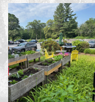
Pic of Raise bed Gardens

The raised bed gardens which were started as a Boy Scout Eagle Project have been a part of the Senior Center for many years. Recently they were refurbished by one of the members of the Council on Aging.