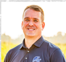
Mark Purple 2024

For more information about scheduling an appointment, eligibility, or the donation process, please call the Kraft Family Blood Donor Center at 617-632-3206 or email BloodDonor@partners.org . Thank you for making a life-saving difference for patients in need.