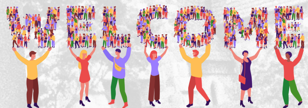
Pic of "Welcome" sign