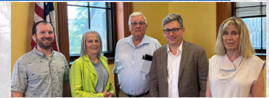
Select Board Members

The Select Board hosts Office Hours once a month, typically on the third