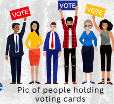
Pic of people holding voting cards

Fall Town Meeting has been rescheduled due to a conflict at Trottier. Please mark your calendars for Monday, October 27 at 6:30 PM at Trottier Middle School, 49 Parkerville Road.