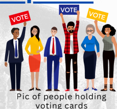
Pic of people holding voting cards

Fall Town Meeting has been rescheduled due to a conflict at Trottier. Please mark your calendars for Monday, October 27 at 6:30 PM at Trottier Middle School, 49 Parkerville Road.