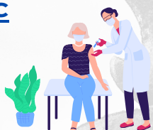
Pic of flu clinic

The Southborough Health Department will host its annual Flu Clinic on Wednesday, October 9, from 10:00 AM–12:30 PM at the Senior Center. Seniors (65+) are encouraged to receive the high-dose flu vaccine, which is shown to provide stronger protection against serious flu complications. Getting vaccinated helps prevent illness, pneumonia, and other health risks, especially for older adults and children. Advance registration is required (no walk-ins). Register online at tinyurl.com/southborofluclinic or call the Health Department at 508-281-8983 for assistance.