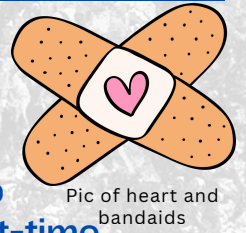
Pic of heart and bandaids

The Greater Boroughs Partnership for Health (a collaboration of Boylston, Northborough, Southborough, and Westborough) is excited to announce an opening for a part-time Regional Public Health Nurse! This dynamic role is all about making a difference providing nursing services across our communities through health education, wellness programs, disease prevention, and public health initiatives.