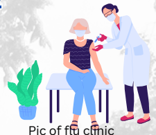
Pic of flu clinic

The Southborough Health Department will host its annual Flu Clinic on Wednesday, October 8 th , from 10:00 AM-12:30 PM at the Senior Center. Seniors (65+) are encouraged to receive the high-dose flu vaccine, which is shown to provide stronger protection against serious flu complications. Getting vaccinated helps prevent illness, pneumonia, and other health risks, especially for older adults and children. Advance registration is required (no walk-ins, please). Register online at tinyurl.com/southborofluclinic or call the Health Dept at 508-281-8983 for assistance.