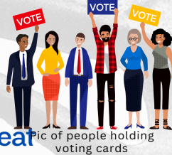
Pic of people holding voting cards

Please mark your calendars for Monday, October 27 at 6:30 PM at Trottier Middle School, 49 Parkerville Road. This is a great opportunity to come together as a community and make a difference! We'll be voting on a variety of important articles, including a significant zoning bylaw that could help revitalize Route 9 & a proposed bylaw for accessory dwelling units [ADU]. Your participation matters & we hope to see you there! Take a look at the details here: https://shorturl.at/ADfNN . The warrant will be finalized and signed at the Select Board's October 7 th meeting.