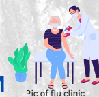
Pic of flu clinic

Register online at tinyurl.com/southborofluclinic or call the Health Dept at 508-281-8983 for assistance.