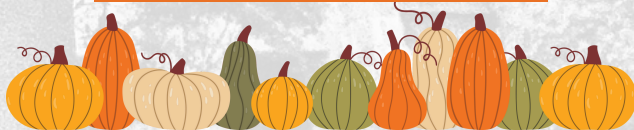
Pic of line of pumpkins

"October is a symphony of permanence and change." — Bonaro W. Overstreet