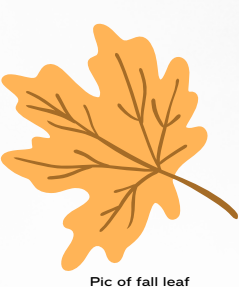
Pic of fall leaf