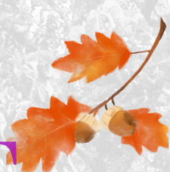
Pic of fall leaf & acorns