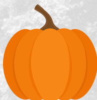
Pic of perfect pumpkin